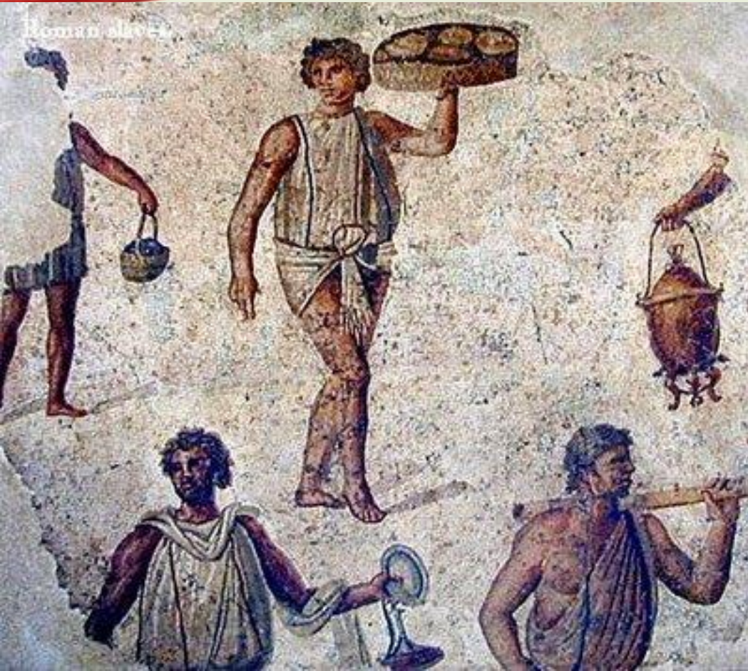
A Roman fresco from the city of Philippi showing slaves at various tasks.